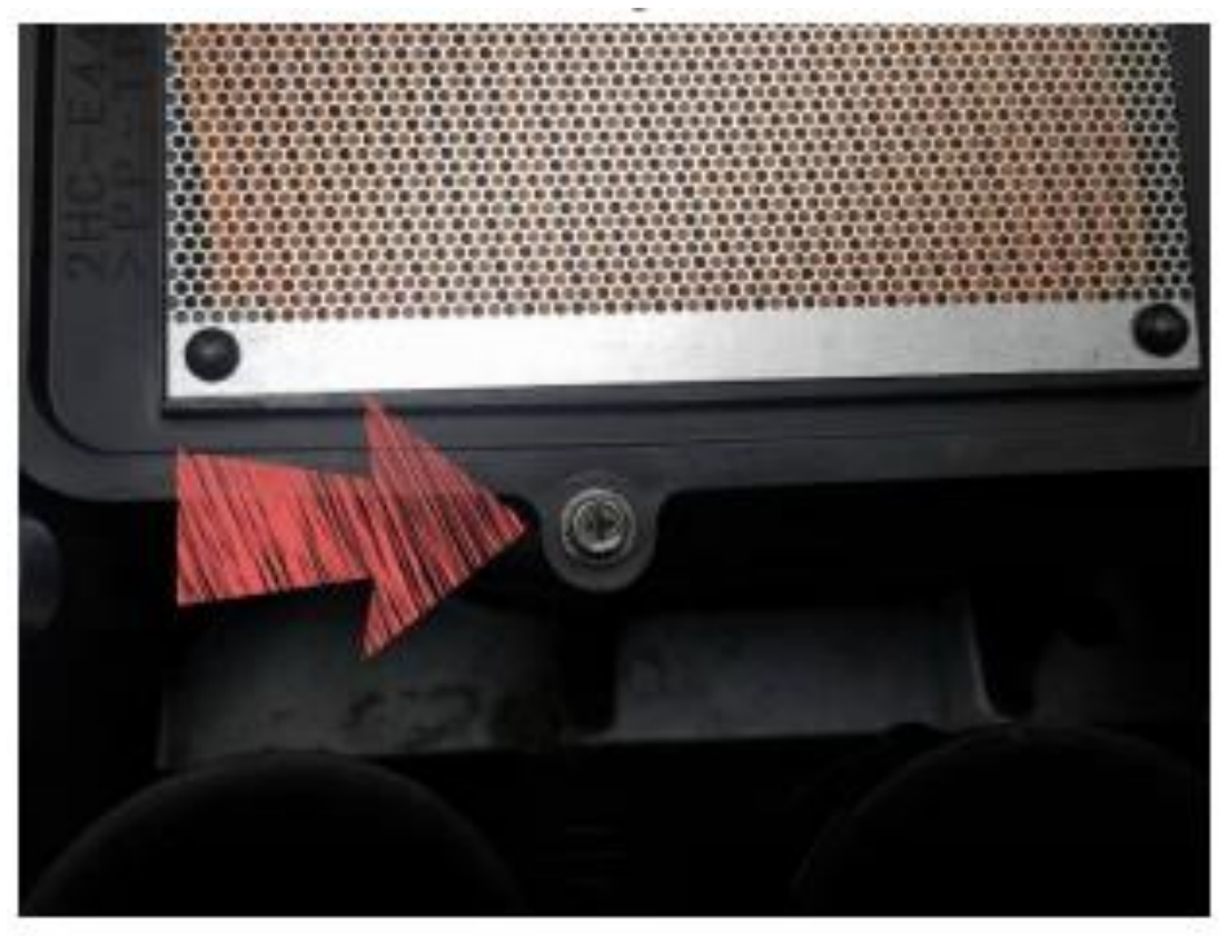
6.Use one of the factory cover retaining bolt to secure the secondary filter in the middle position of the airbox and torque to 18 in/lbs.